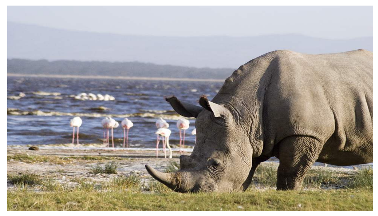
Lake Nakuru - white Rhino

Nakuru National Park : Population of around 60. This is one of Kenya's smaller parks and the rhinos (especially whites) are often seen around the shore of the lake.